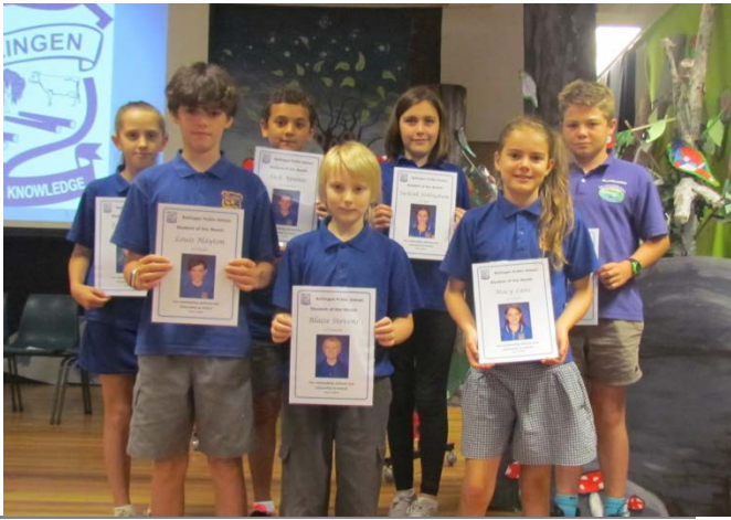
Stage 3 Students of the Month