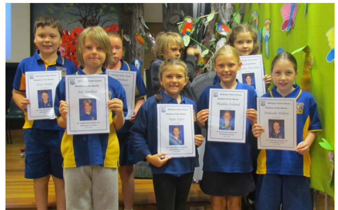
Stage 2 Students of the Month