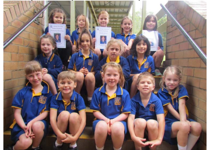
Stage 1 Students of the Month