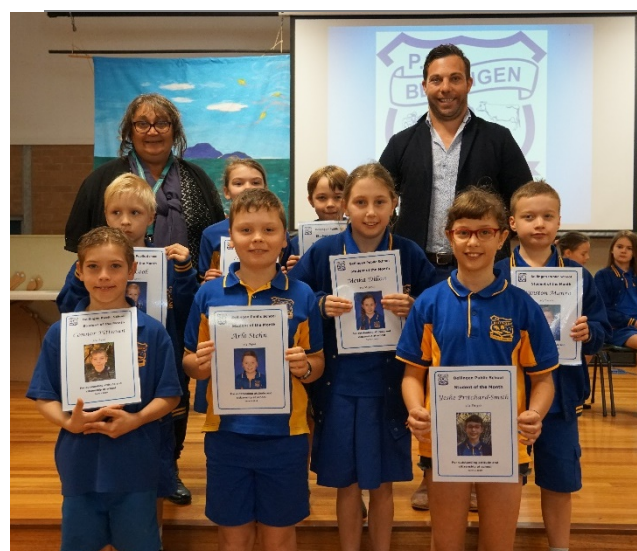
Stage 2 Students of the Month