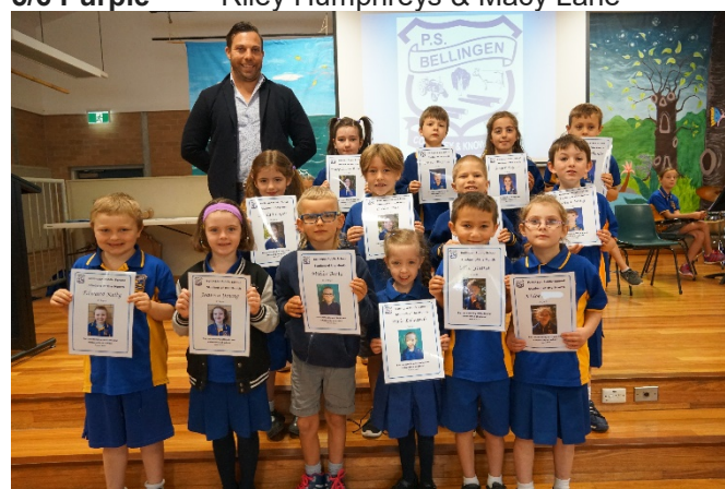
Stage 1 Students of the Month