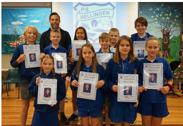
Stage 3 Students of the Month