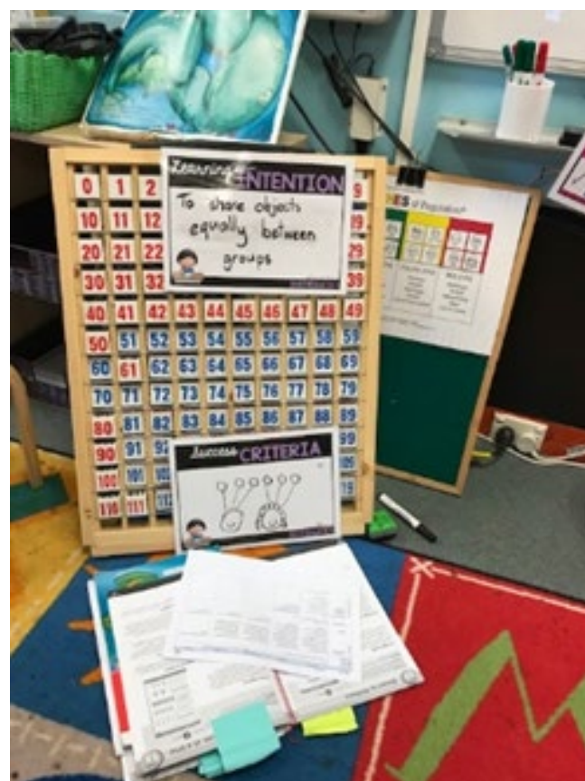
Here are some examples of Learning Intentions and Success Criteria being implemented across the school.

Ask your child to describe what they were learning and how they know if they are successful, rather than what activities they did at school today. In this way you can assist to further reinforce their learning, as they are encouraged to "teach" or "explain" the learning concept to you.