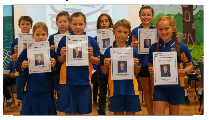
Stage 2 Students of the Month