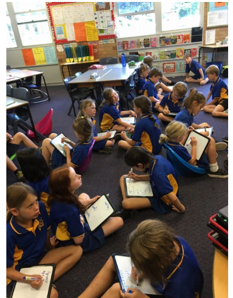
Peer testing spelling words

Evan wrote a wonderful complex sentence: When the sun is shining, it hurts your eyes.