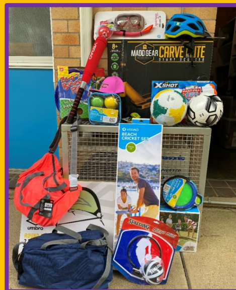
😊 Just some of the great prizes😊