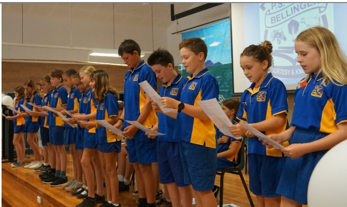
Sport House Leaders making their pledge.