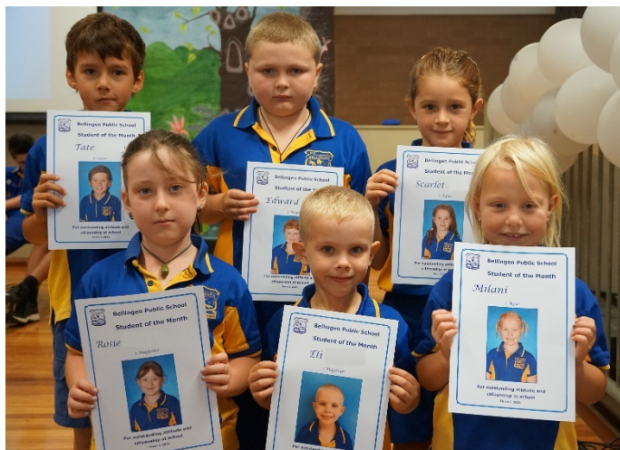
Stage 1 Students of the Month