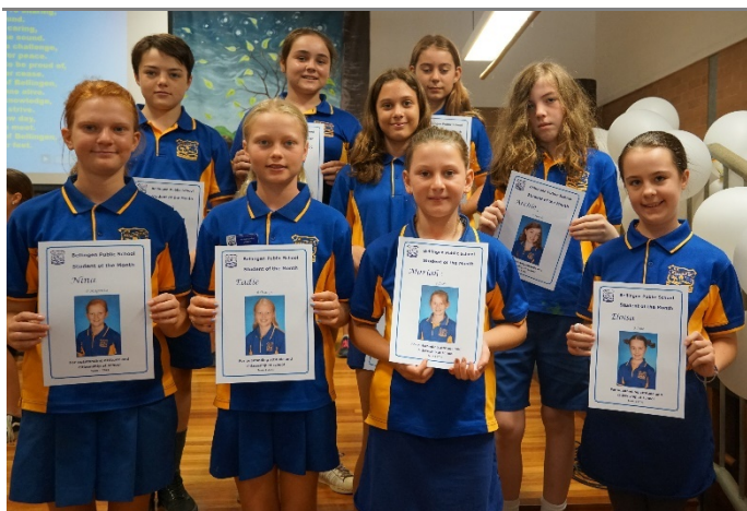
Stage 3 Students of the Month