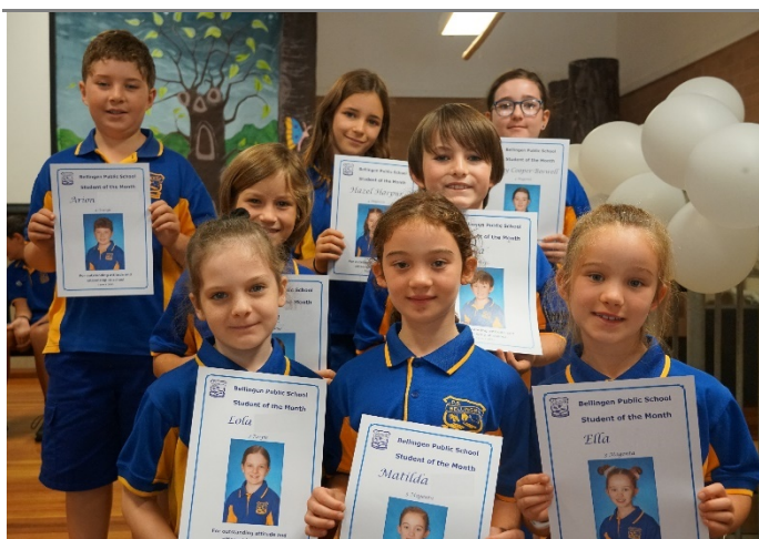
Stage 2 Students of the Month