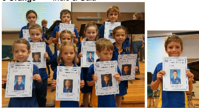
Stage 1 Students of the Month