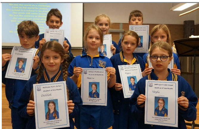
Stage 2 Students of the Month