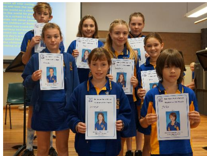
Stage 3 Students of the Month