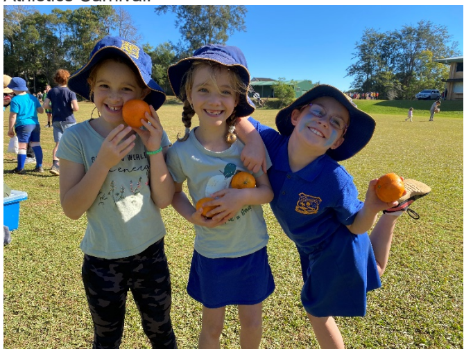
Students enjoying fruit at the Athletics Carnival

The fruit was left to ripen on the trees this year and everyone benefited from the bountiful harvest at the Athletics Carnival.