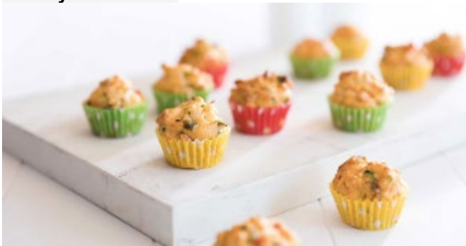
Baked Bean Mini Muffins