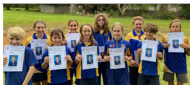
Stage 3 Students of the Month