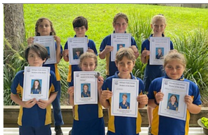
Stage 2 Students of the Month