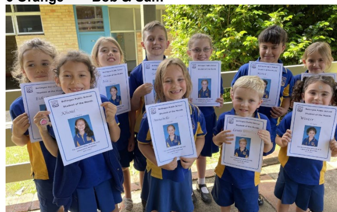
Stage 1 Students of the Month