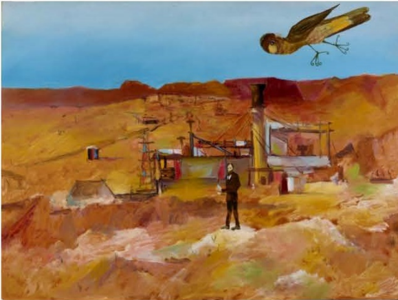
Pretty Polly Mine by Sidney Nolan

We have been reading A Banner Bold in English which is a diarised story of a young girl who immigrates to Ballarat to join the gold rush. We have also been studying The Rabbits which gives a perspective of the arrival of the English from the point of view of the original Australians. This aligns with our History Unit about the colonisation of Australia. Our artwork depicts some of this other learning as we also practiced how to mix primary and secondary colours. We learned about colours that are opposite on the colour wheel and how they contrast to make something appear brighter. We also learned about using tints and shades to our backgrounds, mid-grounds and foregrounds to create the appearance of distance.