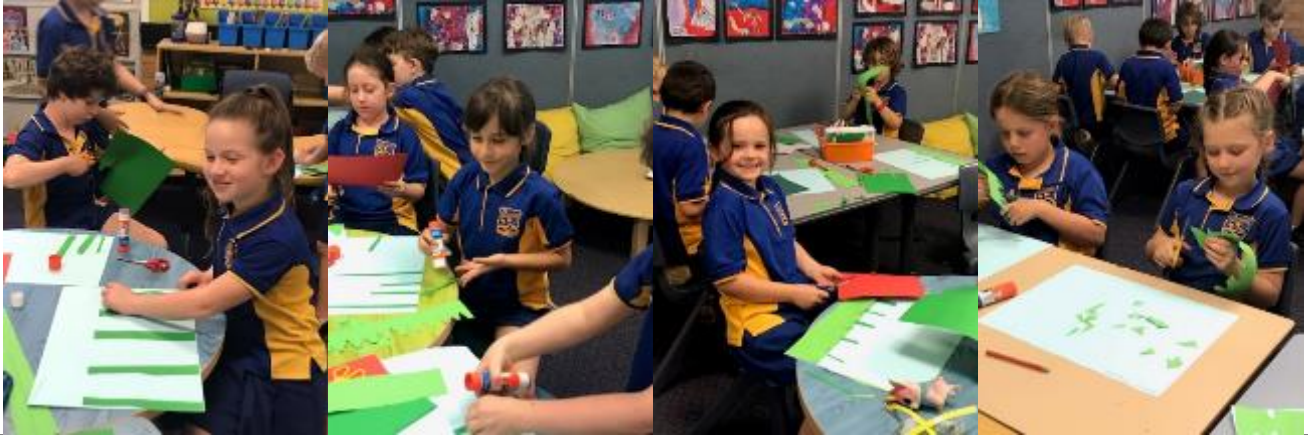
1 Magenta created beautiful artworks of Poppies for Remembrance Day.

'At the going down of sun and in the morning, we will remember them. Lest we forget'