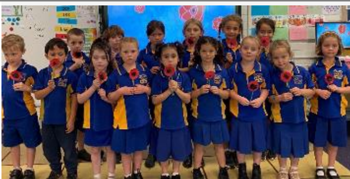
Kinder Aqua made poppies and were very respectful during their learning about Remembrance Day