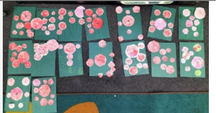
Kinder Jade created 'Poppy Fields' and observed a minutes silence.